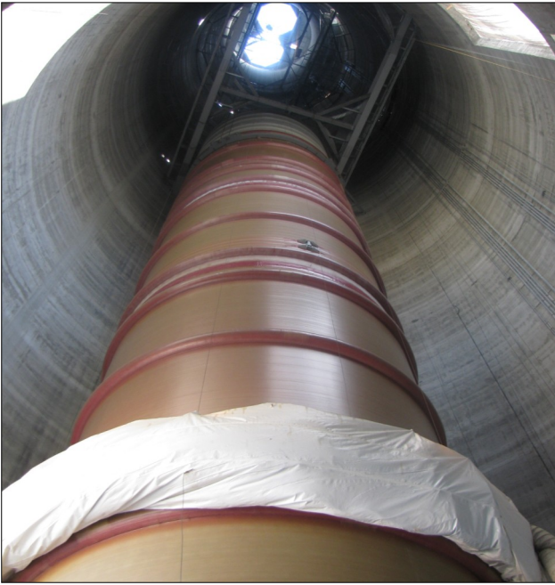
Figure 6: FRP Liner Cans Being Erected in Chimney

inside the chimney. This work should also be scheduled to be completed well in advance of the date the can is needed for erection to avoid delays. Particular care should be taken in planning the assembly of the breeching or elbow entry sections as these items can take considerable time to fabricate and their dimensional accuracy is important to the erection and fit-up of the completed FRP liner (1).