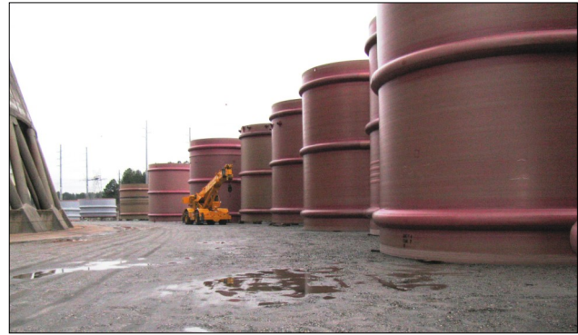
Figure 4: FRP Liner Cans in Storage at Jobsite

Quality Control during fabrication is critical. Although the FRP supplier is responsible for QA/QC for their work, it is normal practice to have third party inspection and oversight of