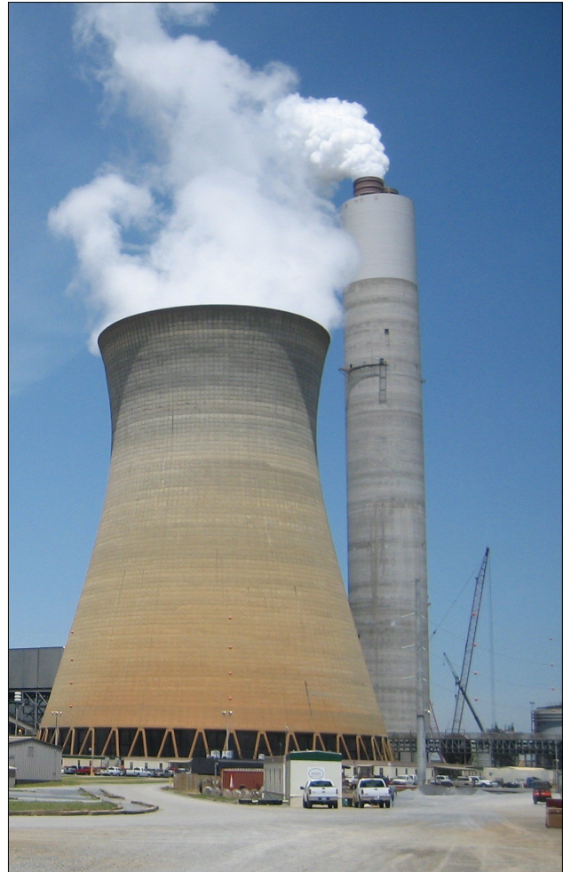
Figure 1: Chimney with FRP Liners on WFGD System

The normal project delivery method for concrete chimneys in the United States is design-build, where the chimney contractor is responsible under a single contract for the complete design, supply and erection of the chimney. Usually, the only subcontracted work is electrical, elevator and coatings. Major material supplies are generally purchased to designs and specifications prepared by the chimney contractor. For most types of chimney liners, such as brick, steel and metal alloys, the chimney contractor preforms the design of the liner, procures the materials or fabricated components for the liner, and installs or erects the liner at the construction site. For FRP chimney liners, due to the specialized nature of the design and manufacturing methods, and the size of the components involved, it is normal practice to have a specialist FRP supplier design and supply the liners, with the filament winding performed on site. (Figure 2) Because of the interconnection of the FRP liner with the design and construction of the overall chimney, many challenges are presented to the chimney contractor and FRP fabricator while working together on a project. This paper discusses several of the major areas where coordinating the activities of the chimney contractor and FRP liner fabricator are critical to realize a well-executed project.