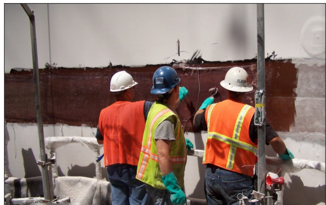
Figure 7: Field Joining of FRP Liner Cans

The work within the chimney must be well planned as the erection will be on the critical path with little other activities which can be performed concurrently. The work area for making the joints between the cans must be safe and allow for efficient work flow. (Figure 7) Access to the area must be convenient for the workers and provide for emergency egress as required by regulations. Safety procedures within the chimney must be strictly enforced, especially regarding fire safety and respiratory protection. The handling and lifting of the FRP liner cans and the raising of the liner should all be thoroughly engineered and performed under a written erection plan.