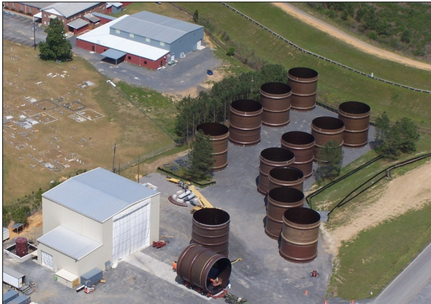
Figure 2: On-site Fabrication of FRP Liners

contractual relationship would typically exist between the companies for the project being considered and there are typically multiple FRP suppliers vying for the work. The chimney contractor must ensure that the FRP suppliers have the information required for performing and coordinating the design of the FRP liner. The major design coordination issues that must be addressed are shown in Table 1.