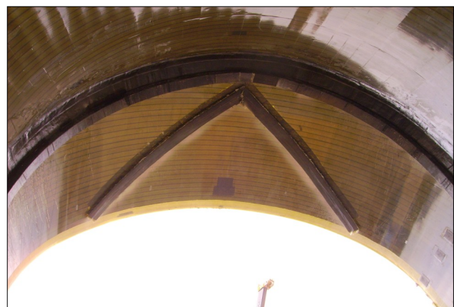
Figure 5: Liquid Collectors Pre-installed in Liner Can

All accessories which are to be attached to the can should be installed in the yard prior to erecting the can. (Figure 5) This will avoid increasing the erection time to perform this work